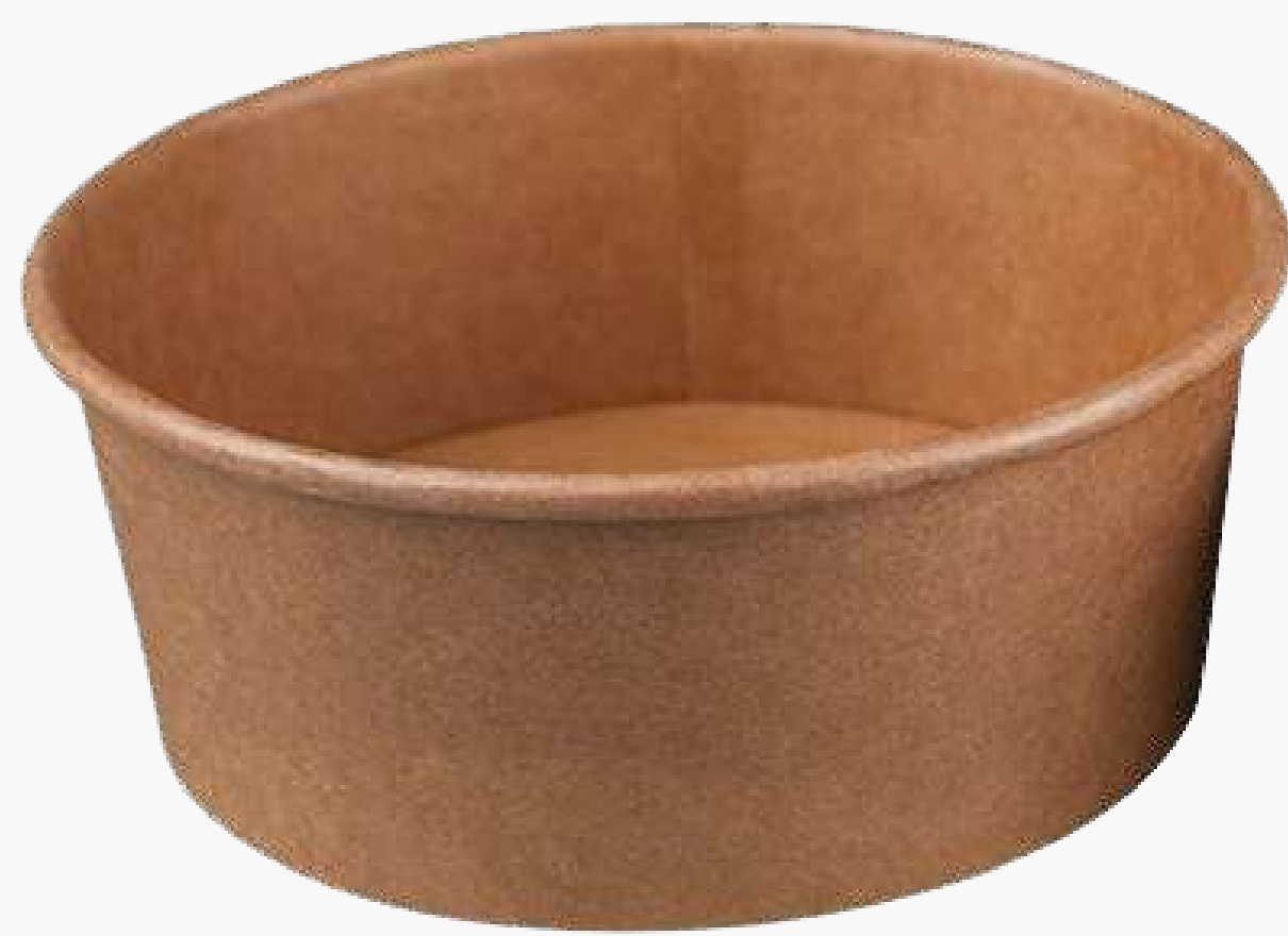
Paper Container 1000ml

Dimensions: Bottom Dia 112mm x Height 100mm, Upper Dia 140mm