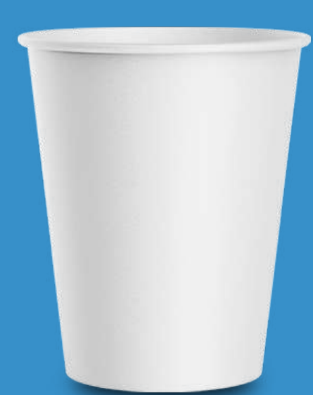
7oz Single wall paper