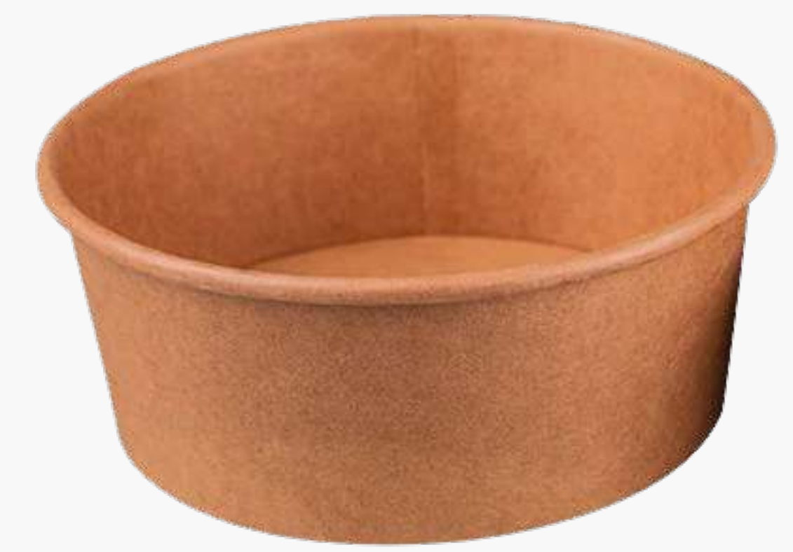
Paper Container 750ml

Dimensions: Bottom Dia 84.19mm x Height 110mm, Upper Dia 110mm