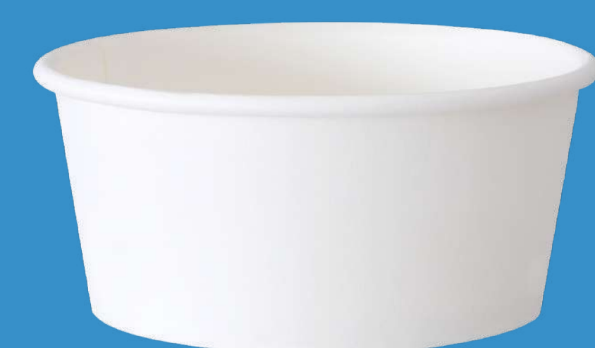
White Paper Container 1000ml