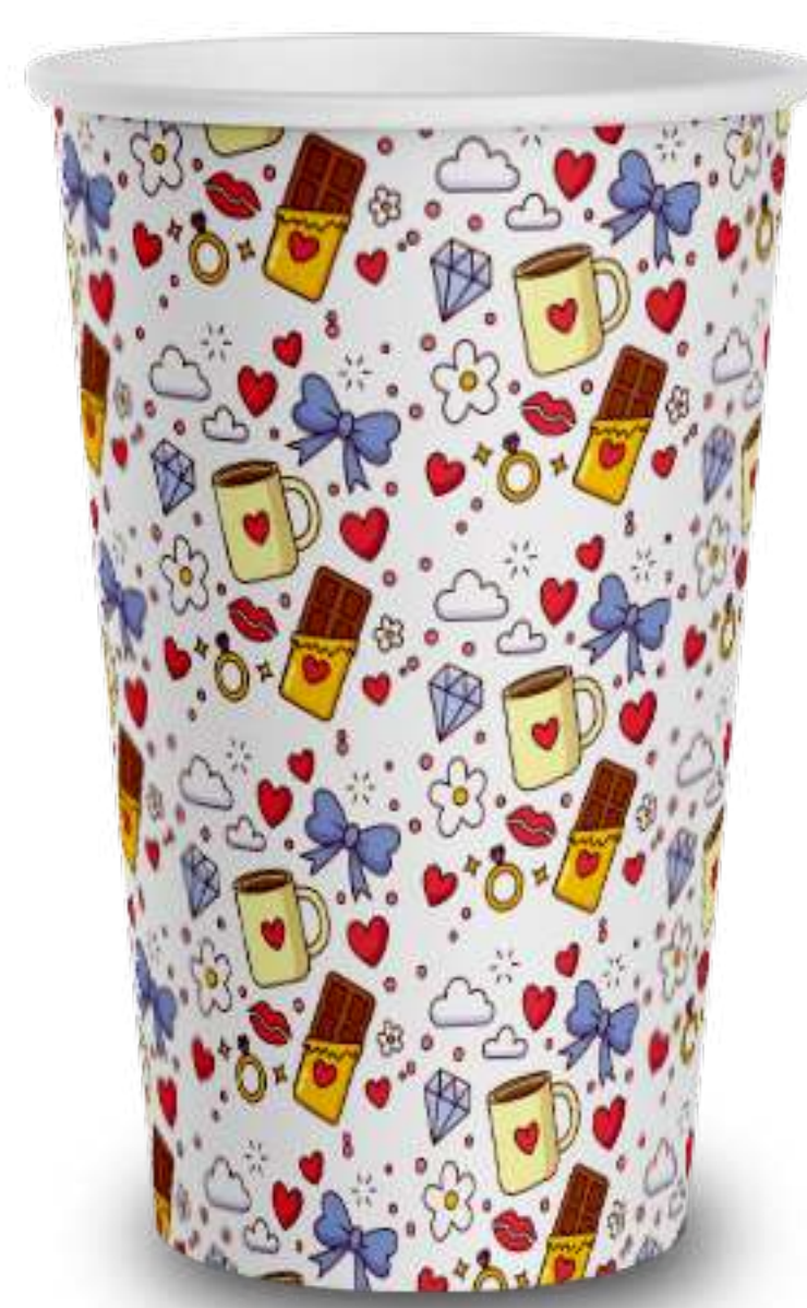
16oz (360ml) Single Wall Paper Cup

Dimensions: Bottom Dia 58mm x Height 137mm, Upper Dia 90mm