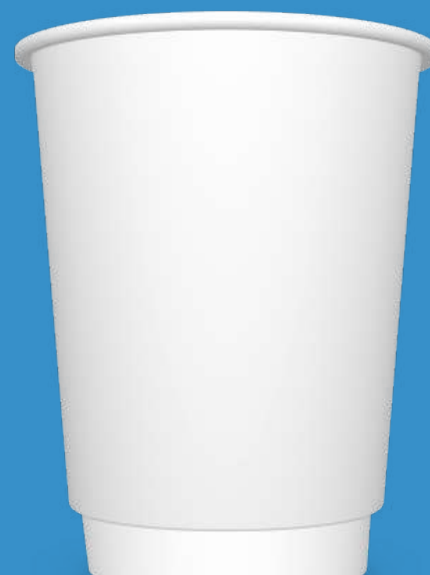
12oz Double wall paper