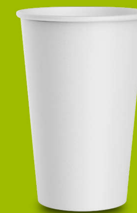
16oz Single wall paper