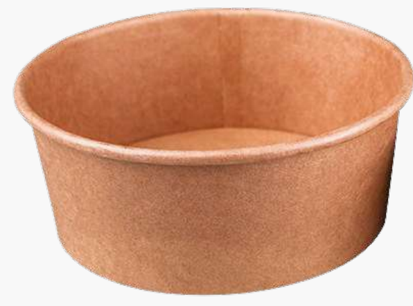
Paper Container 250ml

Dimensions: Bottom Dia 92mm x Height 50mm, Upper Dia 110mm