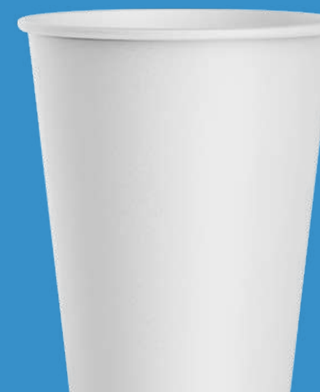
12oz Single wall paper