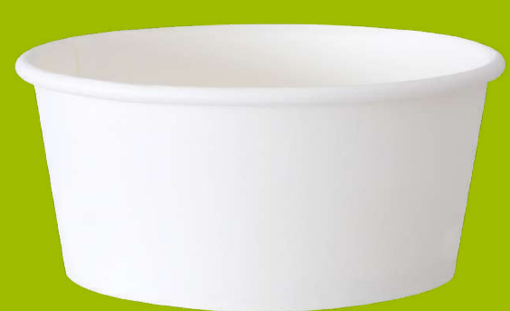
White Paper Container 250ml