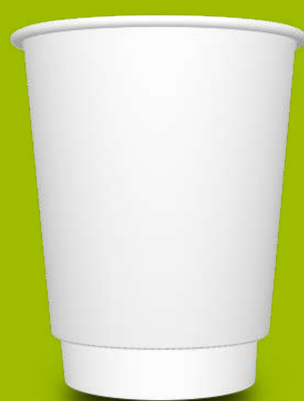
8oz Double Wall Paper