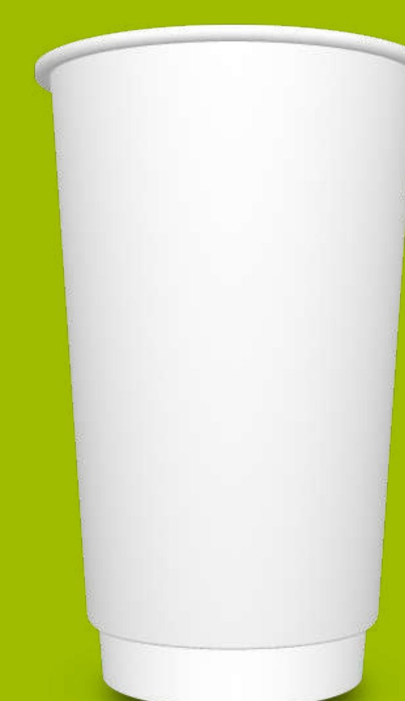
16oz Double wall paper