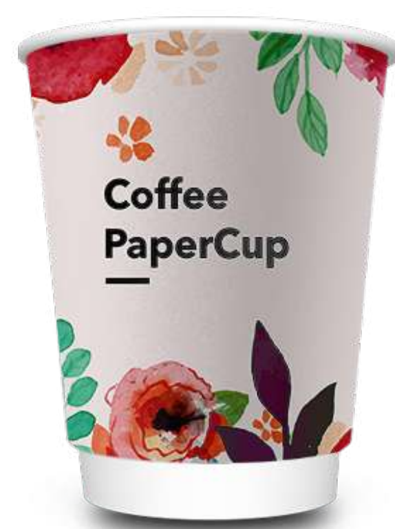
8oz (250ml) Single Wall Paper Cup

Dimensions: Bottom Dia 54mm x Height 92mm, Upper Dia 80mm