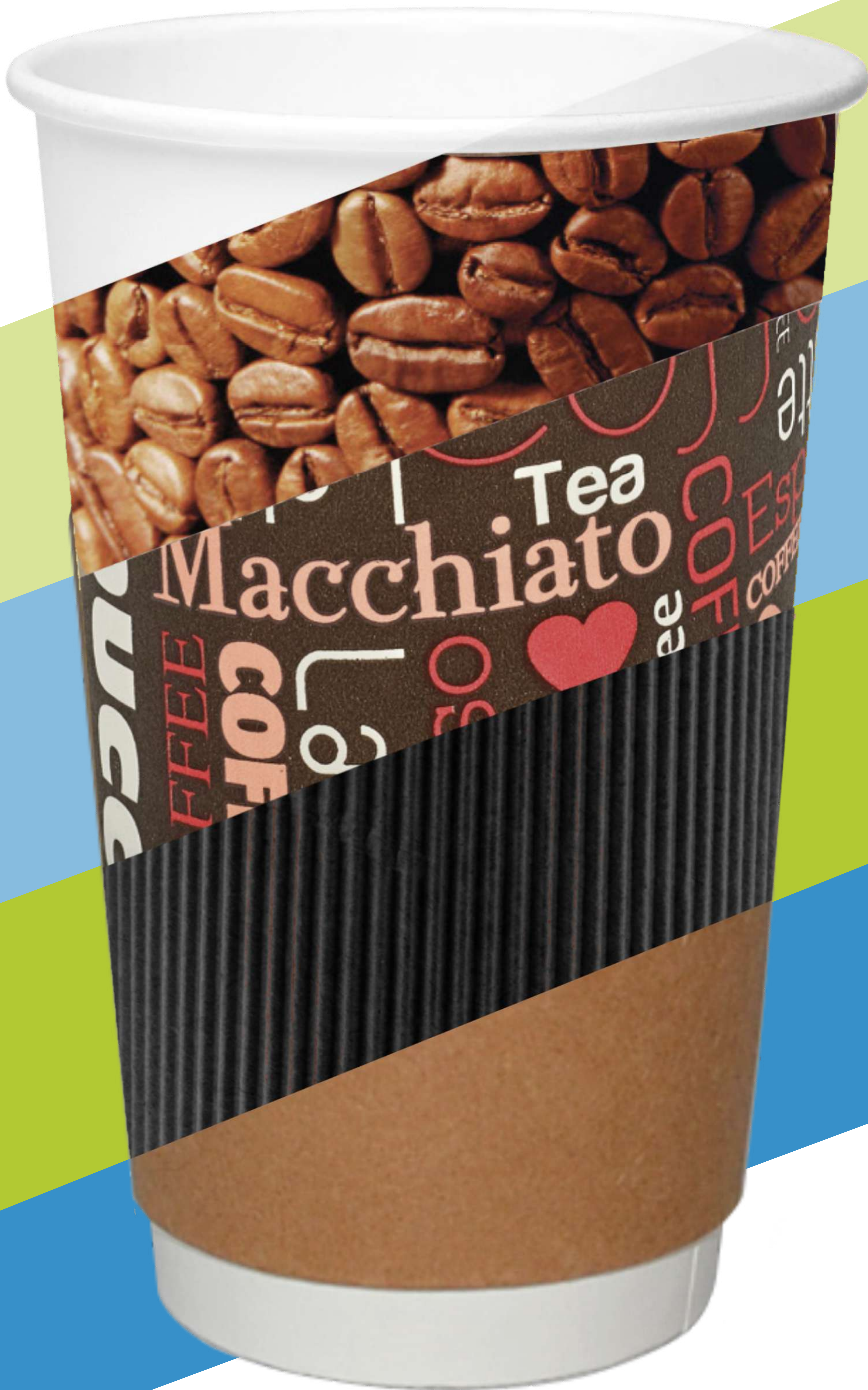
Double wall Paper Cup