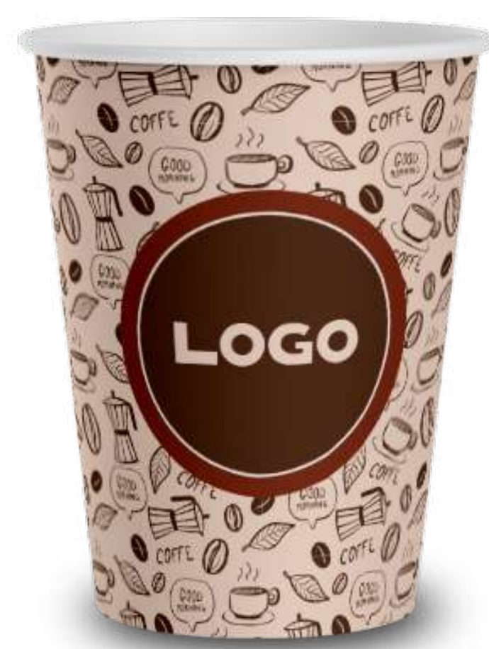
7oz (210ml) Single Wall Paper Cup

Dimensions: Bottom Dia 52mm x Height 75mm, Upper Dia 72mm