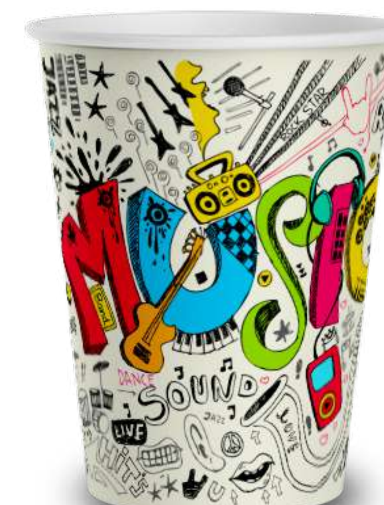
12oz (360ml) Single Wall Paper Cup

Dimensions: Bottom Dia 58mm x Height 110mm, Upper Dia 90mm