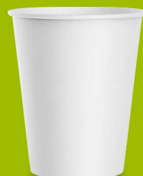
8oz Single wall paper