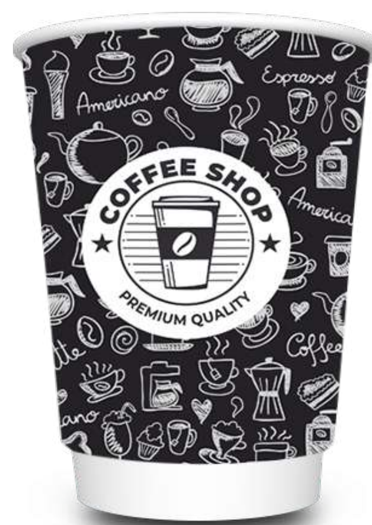
12oz (360ml) Single Wall Paper Cup

Dimensions: Bottom Dia 58mm x Height 110mm, Upper Dia 90mm