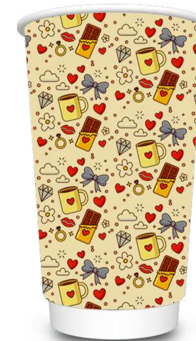
16oz (360ml) Single Wall Paper Cup

Dimensions: Bottom Dia 137mm x Height 58mm, Upper Dia 90mm