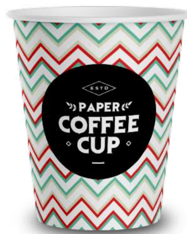
8oz (250ml) Single Wall Paper Cup

Dimensions: Bottom Dia 54mm x Height 92mm, Upper Dia 80mm